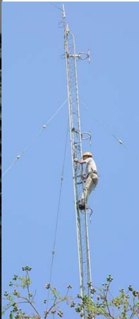
Brice on WQRZ-LP tower

tower was 3 feet underwater but we were still on the air.