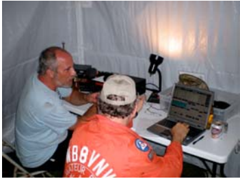
SB voices at night, K4BRI & Read The Jacket