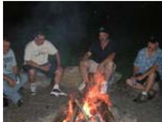
Not sure if this was before or after midnight feast

http://s280.photobucket.com/albums/kk188/Kc8zlf/OHKYIN/ is where the photos still are, fortunately. Please go there if you haven't already; you can see them ALL in COLOUR! Thanks very much, Ben! – Ye Ed