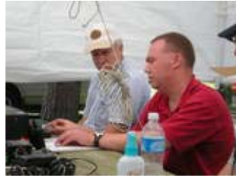
CW, of course – KA3MTT