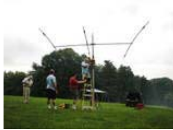
Beams did have to go up ...