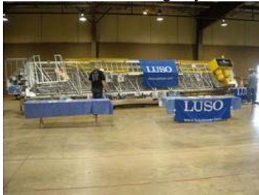
I had to stand wayyyy back and use the wide-angle lens for this photo of Luso's 44-meter crank-up tower! Do you think the neighbors would notice?

So how does one survive a multi-day event like the Dayton Hamvention with miles of aisles? Here's a tip -- take one pair of comfortable, but different, shoes for each day. That way, at least different parts of you will hurt the following day!