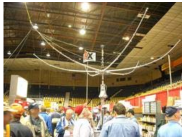
Lots of folks got a good cramp craning their necks to inspect DX Engineering's new hexagonal beam. (Photo – N0AX)

from ARRL Contest Update for 5.27.09 Ward Silver N0AX, editor & photographer