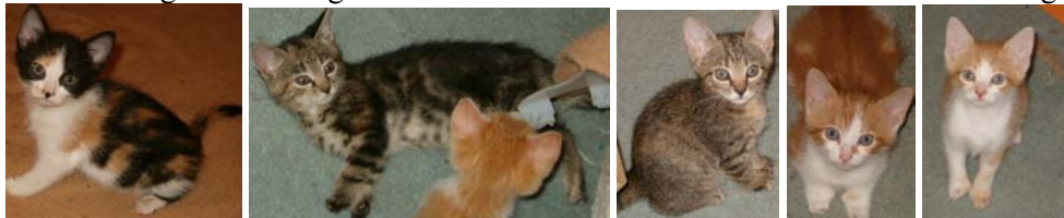
Cali (F) Tori (F), back of Stripe's head Tiger (F) Stripe (M) Jimmy (M)

In the wake of a story on the evening news, it looks as if the number of cats available for adoption has just skyrocketed again, with the confiscation of the 70 (!) that one of Cincinnati's crazy cat ladies had collected – many of whom need medical attention. On the same topic, WD9HDZ & I returned from vacation on Aug. 7 to find 5 small kittens lurking under one of the evergreens by our garage. No mother in sight, then or ever. With the hawks flying, we both thought it best to get the little ones under cover – which led to us fostering them.