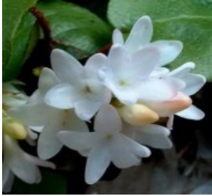
Trailing Arbutus - wee bit different from traditional Shamrock