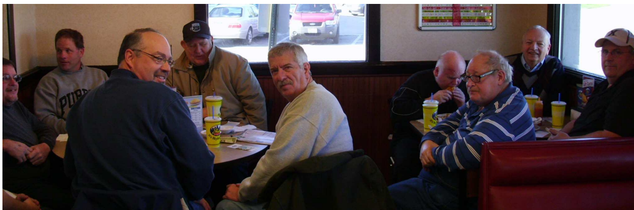
--Reprinted with permission of American Radio Relay League from pg 99, January 2012 QST December 10 Brunch Bunch at Harrison OH Skyline Chili. One of the wait staff took the picture

The application process is now completely electronic. Paper applications are not accepted. In addition, applicants must submit a complete and current electronic transcript, which can be attached to the application.