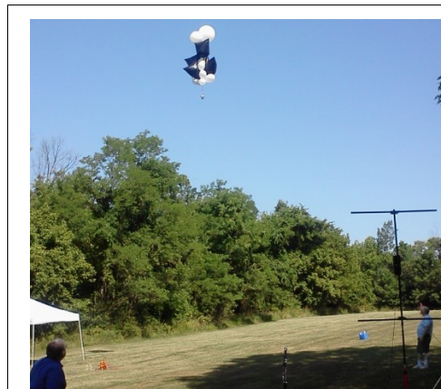
Highest recorded altitude of ill-fated balloon launch – tale at website