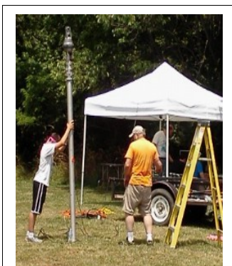
Setting up retractable mast