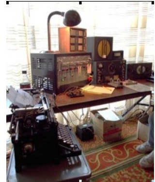
This is what remote operation looked like a few years ago! Hooked up to K6KPH at the Pt Reyes station, the Maritime Historical Radio Society operated this station at the Pacificon convention.

I am sending 1000 "Thank-Yous" to everyone who participated in the Statewide Simulated Emergency Test on Oct 6-7. The old-timers tell me it's been almost 30 years since Ohio has had a Statewide SET, & I can tell you most everyone met the critical criteria of Notification, Activation, Mobilization, & Deployment. I thank Team W8SGT for being on the air for the full 24 hours from the State of Ohio EOC. I also