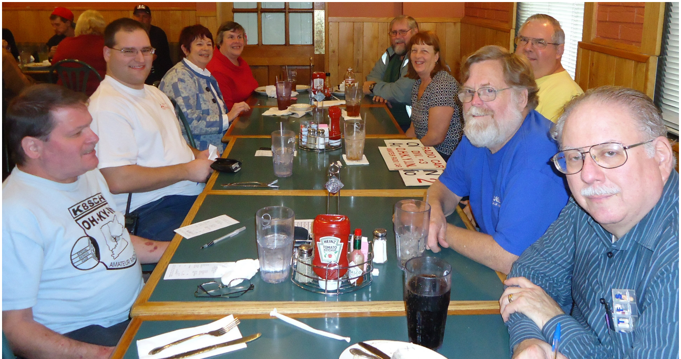
Brunch Bunch at Price Hill Chili on Saturday, Jan 12, 2013.

The next Brunch Bunch will be held Saturday, February 9 th at Fricker's in North College Hill. Frickers is located at 1580 Goodman Drive, 45224, a very short distance from the intersection of West Galbraith Road and Hamilton Avenue. They are also just minutes south of the Hamilton Avenue exit off Ronald Reagan Highway. Fricker's website has a map as well as a downloadable menu at: http://www.frickers.com/Locations/1580-Goodman-Dr/