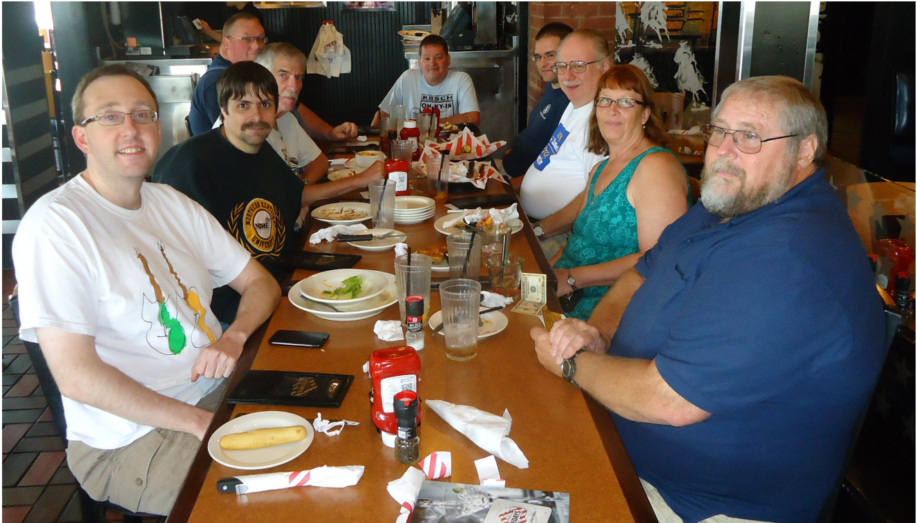
Brunch Bunch at TGIFridays, 6330 Glenway Ave on June 8

On July 13 we'll meet at Cabana on the River, 7445 Forbes Rd in Sayler Park. Menu, directions, etc at www.cabanaontheriver.com . We were there once before, a few years back. Please look for this: