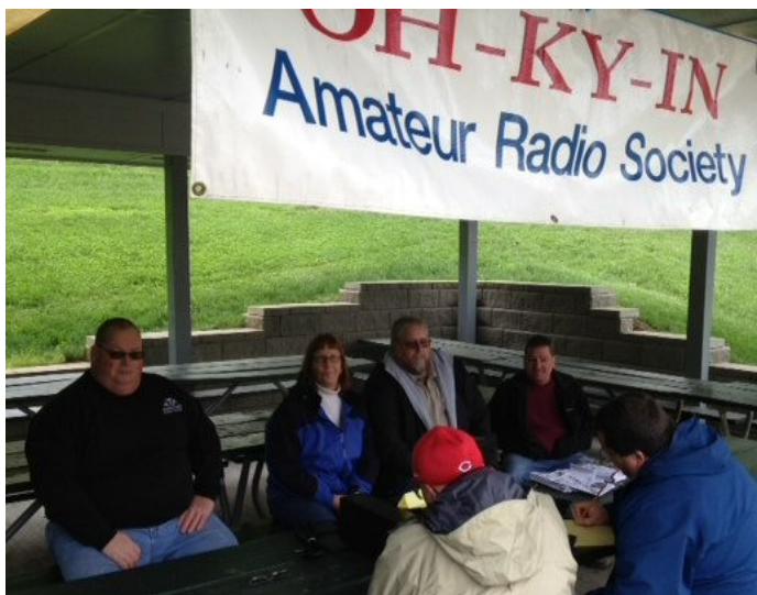
Club location in Vine Street Park at May 11 St Bernard Community Day Block Party