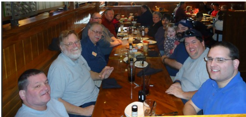
Those depicted above turned out for the Saturday March 8 Brunch Bunch at Outback Steak House in Kenwood. More than achieved the one on the Far East Side in December!