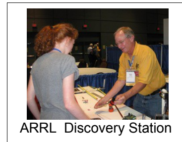
ARRL Discovery Station