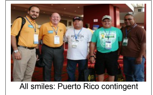
All smiles: Puerto Rico contingent