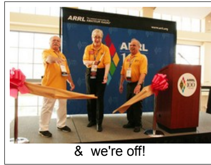
& we're off!