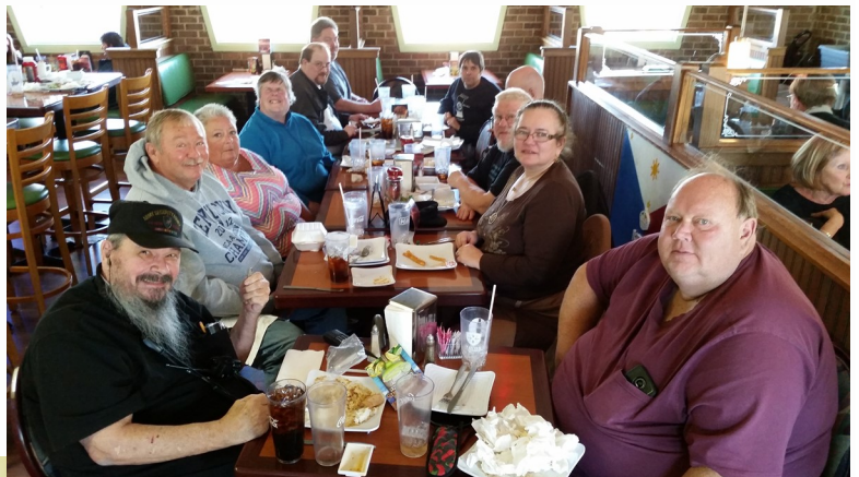
November Brunch Bunch at Christines