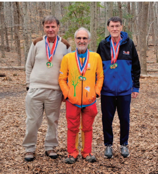
◆ After the 80M competition