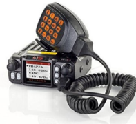
Wouxun KGU920P Transceiver