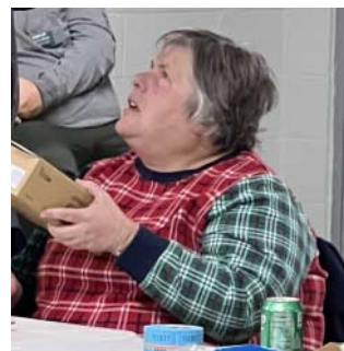
◆ Kitty W8TDA, won a V80, declined it and then won a power supply!