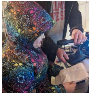
◆ Rocky's daughter making a contact