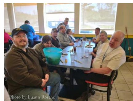
◆ April Brunch Bunch group