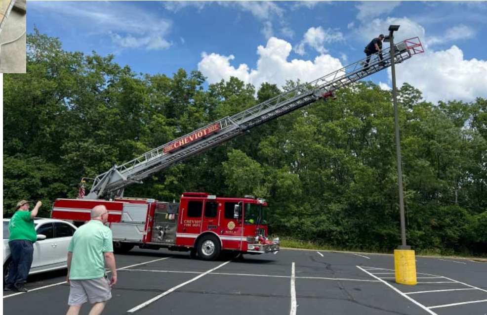
◆ The Cheviot Fire Department stops by