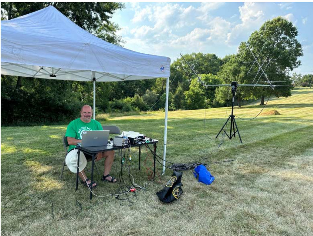
◆ Cesi KD8O0B setting up the satellite station