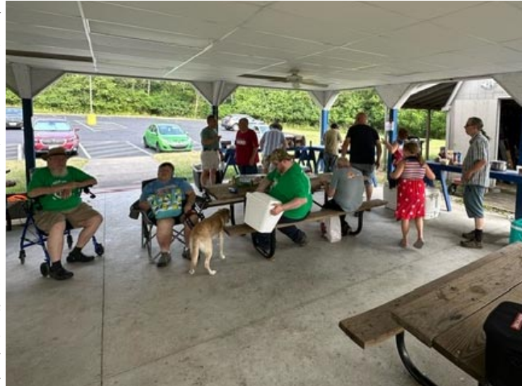
◆ Getting setup for the OH-KY-IN ARS summer picnic

Satellite operations proved difficult as usual. Some of the problems from last year were resolved, but new problems cropped up, most of which were overcome. Three contacts were made using FM satellites. For some reason, the station could not be heard on the linear transponder satellites, which is our usual bread-and-butter. This will be the challenge to solve for next year.