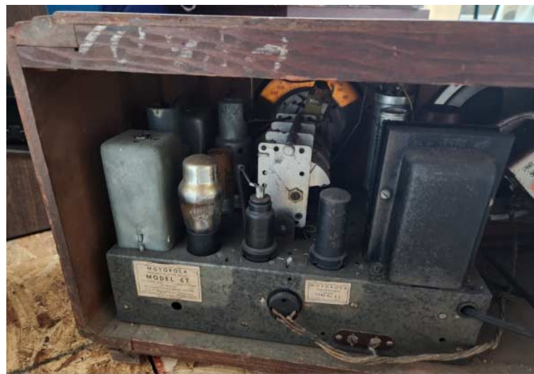
◆ A project piece: Motorola Model 6T Type No. 6-2 combination broadcast AM/shortwave receiver. This item will likely require some work to make it operational. The cabinet has some stains on it and a knob is missing. If you are looking for a piece of radio history and/or a restoration project, this radio could be for you.