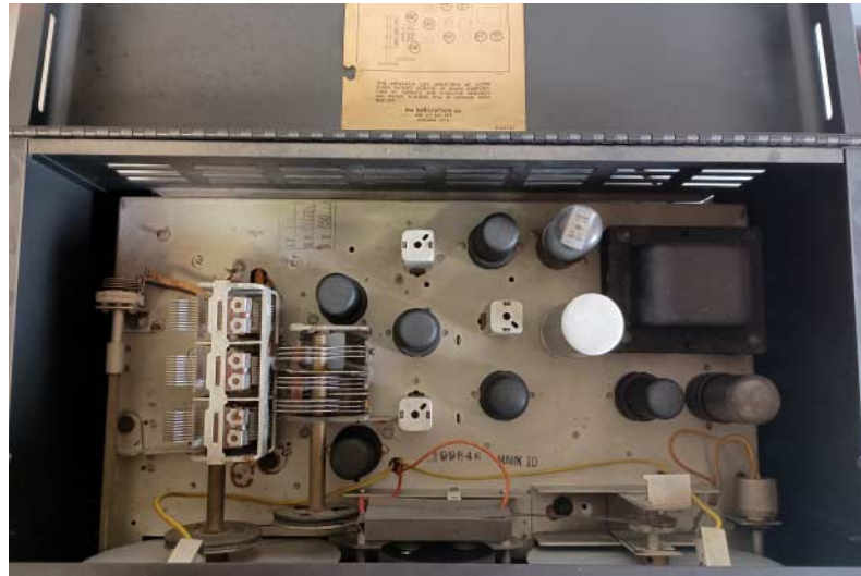
◆ A beautiful, fully serviced and recap'd Hallicrafters SX-99 shortwave receiver. This radio is fully operational and ready to go.